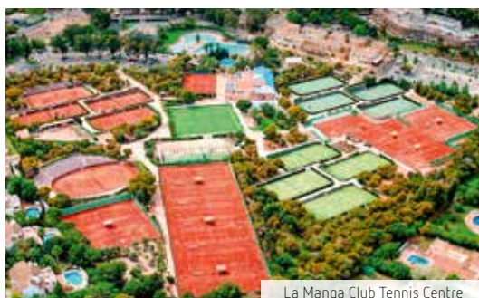
La Manga Club Tennis Centre